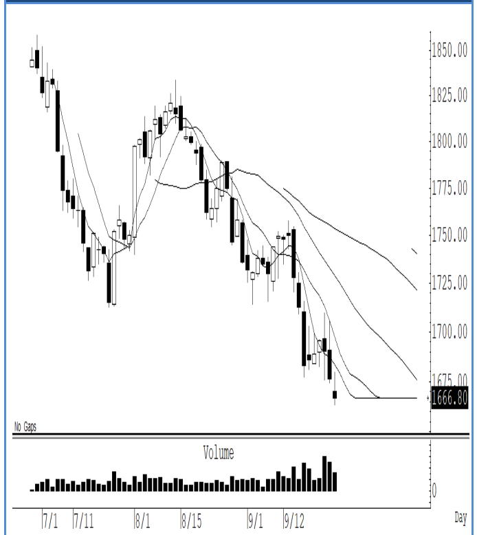
GOZ22 (Close 1,666.80 Chg -9.70)

ราคาทองคำโลกปรับตัวลงทำจุดต่ำใหม่ รอบนี้ถ้าปิดต่ำกว่า 1,640 ดอลลาร์ คาดว่าจะปรับตัวลงแรง สั้น ๆ ตีกลับไม่ข้ามแถว ๆ 1,665 ดอลลาร์ แนะนำ trading ในกรอบระหว่าง 1,665-1,600 ดอลลาร์ ระวังกำไร หรือในกรณีที่ปิดต่ำกว่าระดับ 1,600 ดอลลาร์ แนะนำ ถือ short หวังผลปรับตัวลงไปแถว ๆ 1,520 ดอลลาร์ ระวังกำไร